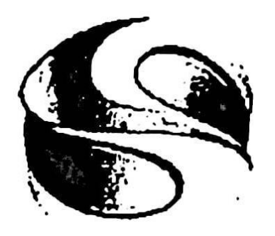
("Defendants' 'S' Trade Mark")

[8] That notwithstanding, the fifth defendant had on 23 April 2018 also applied to MyIPO to register the following mark in class 9, 16, 28, 35, 36, 38, 41, 42, 43 and 44: